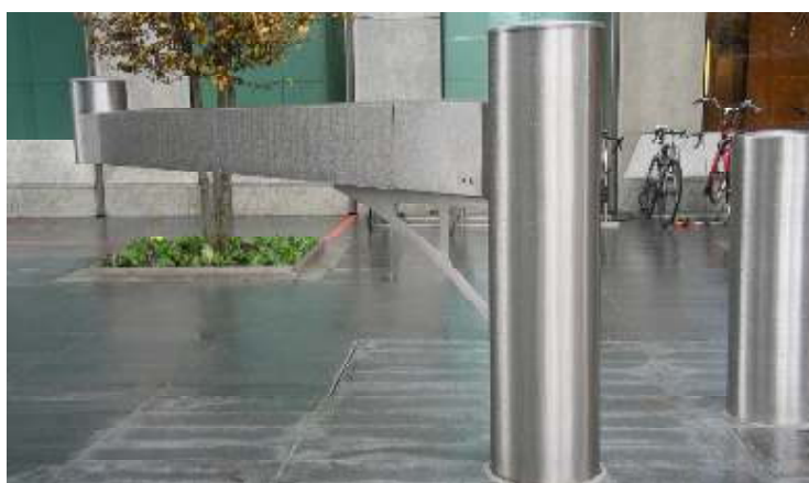
Canary Wharf Financial District