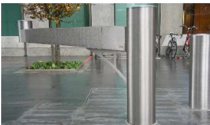
Canary Wharf Financial District